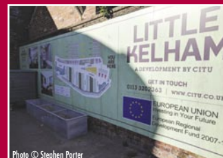
Little Kelham project, Sheffield