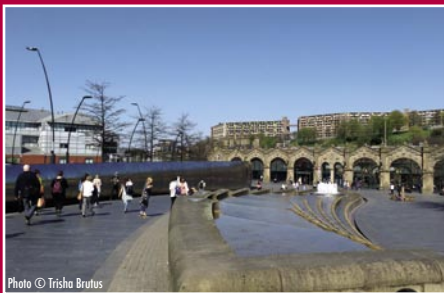
Sheffield Train Station, The Blade & Fountain