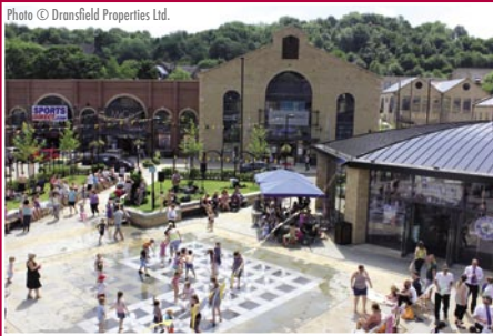
Fox Valley Shopping Centre, Stocksbridge