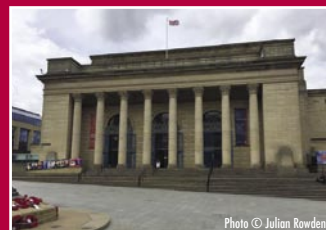
City Hall, Sheffield