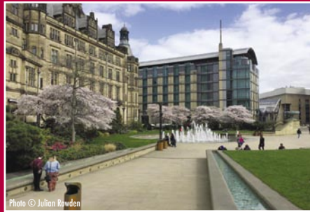
Peace Gardens, Sheffield