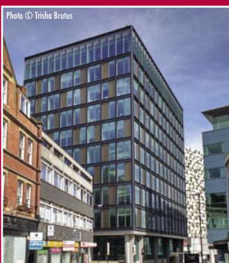
3 St Paul's Place, Sheffield