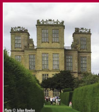
Hardwick Hall, Derbyshire