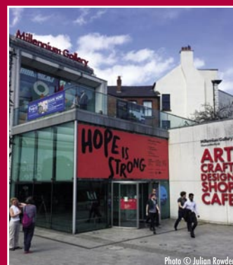
Millennium Galleries, Sheffield