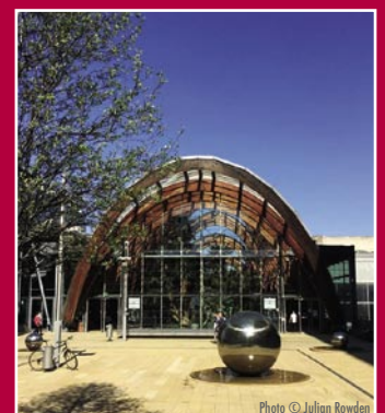
Winter Garden, Sheffield