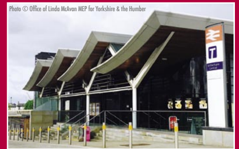
Rotherham Train Station