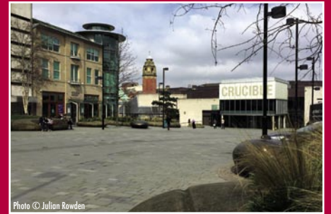
Tudor Square, Sheffield