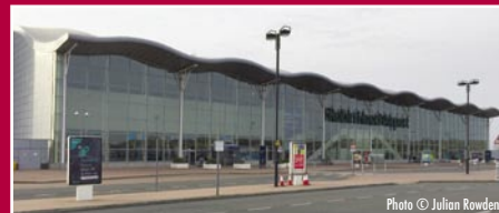
Doncaster-Sheffield Robin Hood Airport