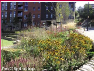
River Don Smithfield Footbridge (top), and Edward Street Park, Sheffield